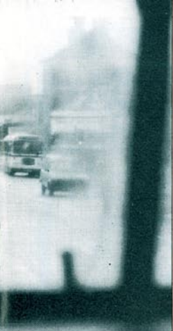
Belfast scene . . . hammering rain, flashing lights and a car-bomb warning.