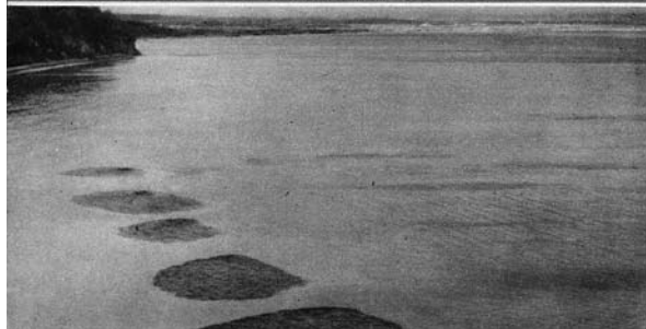
Above: oil projected into the sea from pipe-lines to form a continuous line ready for ignition. Below (left): the oil is ignited; (centre) the sea is on fire; (right) finger of flame used on ships against low-flying aircraft.