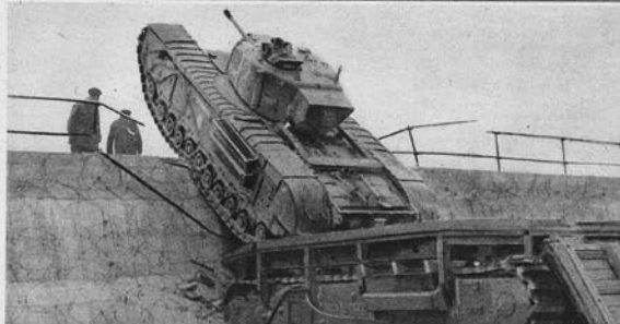
The "Ark" bridge tank formed a ramp up which armoured vehicles were able to advance to scale such obstacles as sea walls.

(Right): An RAF Lancaster takes off between walls of flame. Outside the fringe of fire there is impenetrable fog through which no plane could attempt to take off or land in safety. FIDO produced a four-mile visibility within a region covered in dense fog belts. Fifteen operational airfields were equipped with this apparatus.