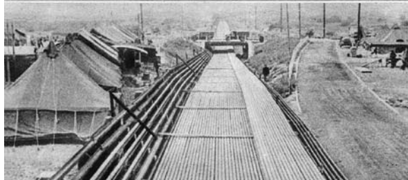
Two hundred miles of three-inch hollow steel cable stretch into the distance at a pipe-line storage depot.