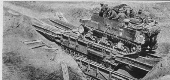
Tank-carried bridges were used extensively in Italy. Here a self-propelled gun crosses an obstacle by means of an "Ark" type bridge.